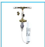
Installation Rail with FILTER XL In-Line Filter.