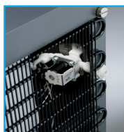
FloodGuard - Inlet solenoid only opens to allow water into the cooler, when water is dispensed. By remaining closed all other times it protects the cooler against leaks.