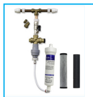
Installation rail with green Filter Housing and green Carbon Block Filter Candle or green nanofilter Candle.